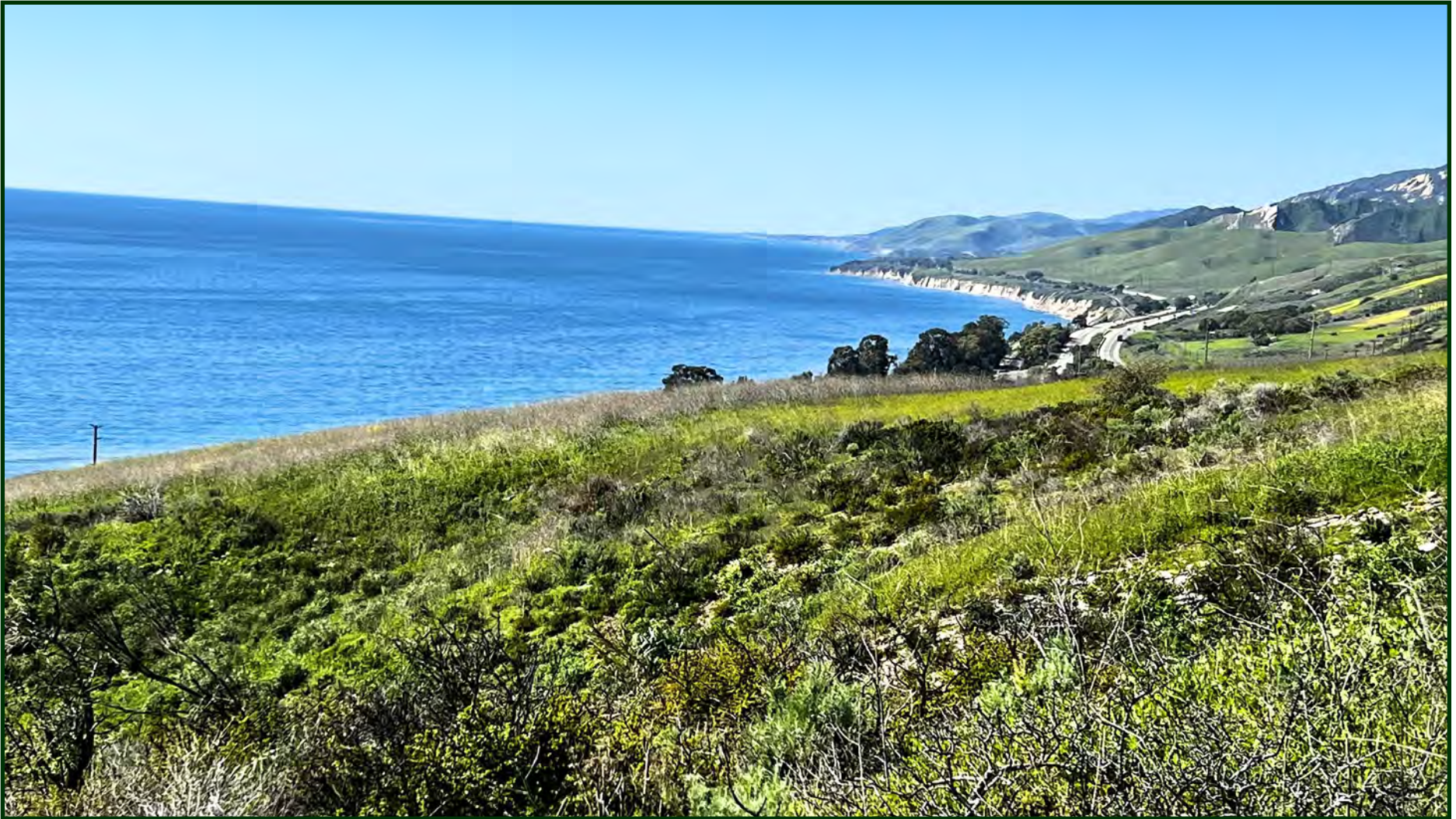
View of the Gaviota Coastline (Looking toward the west from the lower portion of the Property)