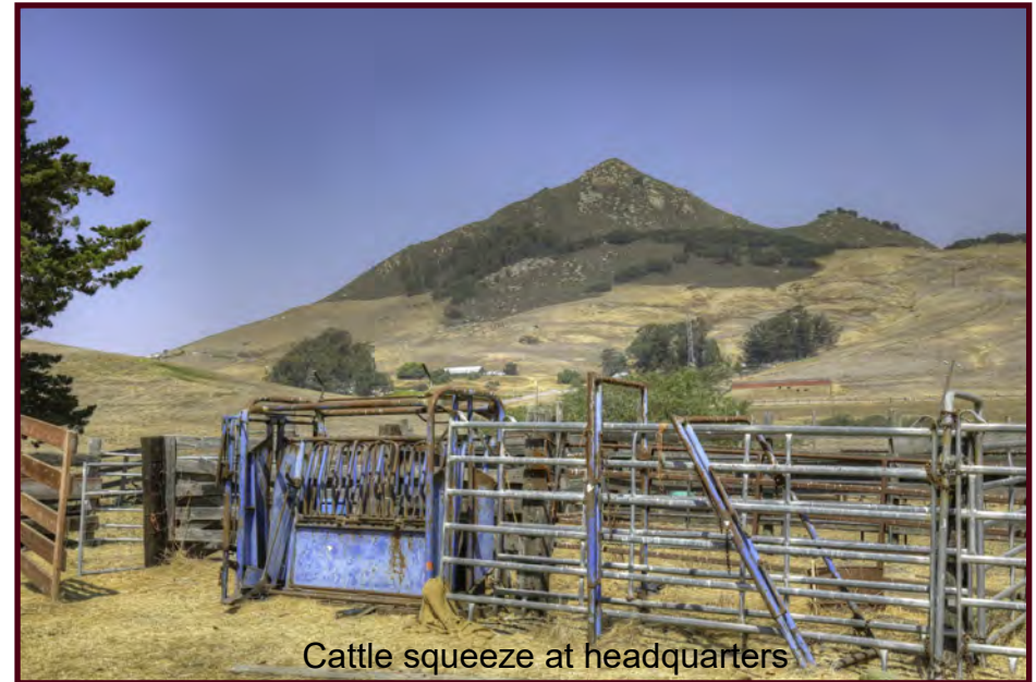
Cattle squeeze at headquarters