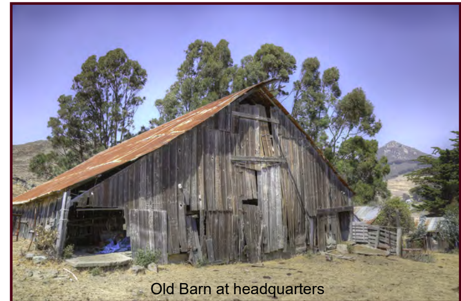
Old Barn at headquarters