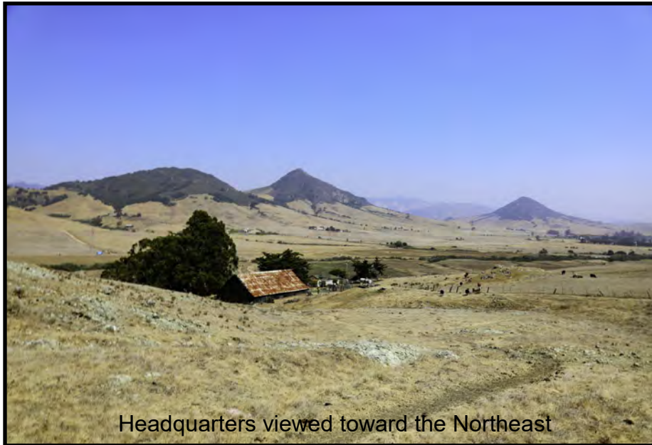
Headquarters viewed toward the Northeast