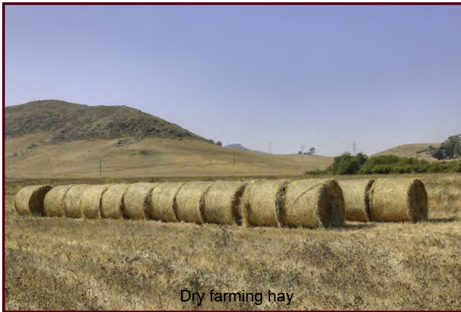
Dry farming hay